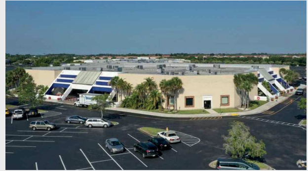
Orange Blossom Mall