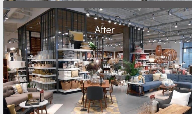
West Elm Tennant Build Out