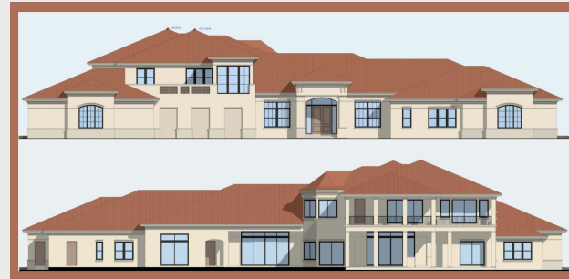
13,000 sqft Custom Home